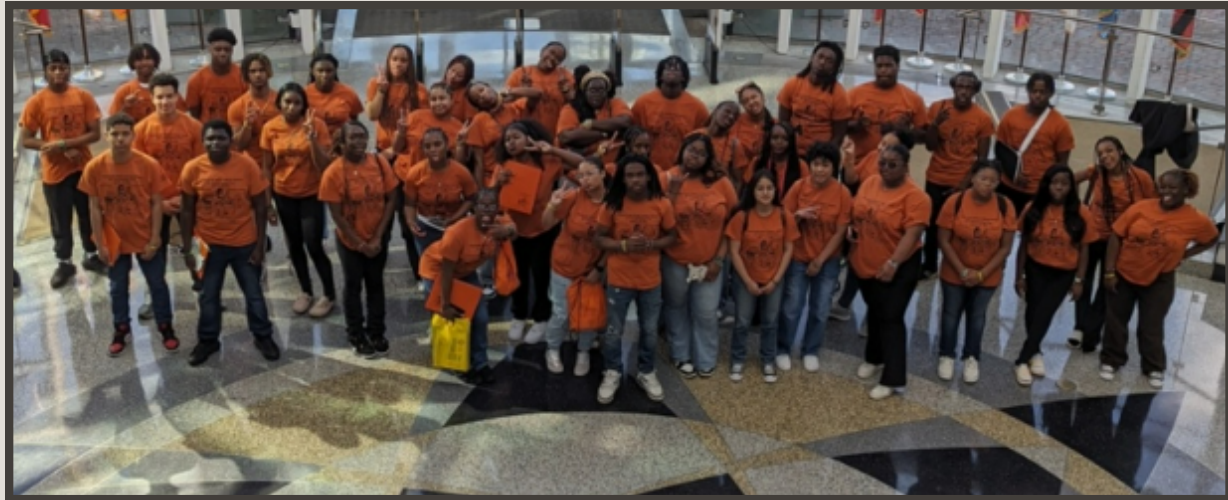
Student tour group visiting Norfolk State University in Norfolk, VA